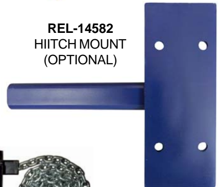
REL-14582 HIITCH MOUNT (OPTIONAL)