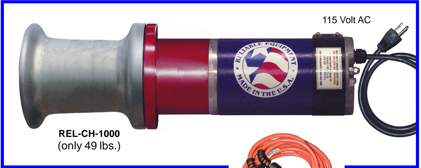
REL-CH-1000 (only 49 lbs.)

92 STEAMWHISTLE DRIVE • IVYLAND, PA 18974 • FAX: 215-357-9193 • TOLL FREE: 800-966-3530