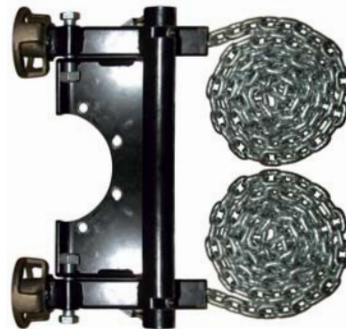
R-CH-BRACKET UNIVERSAL MOUNT (OPTIONAL)