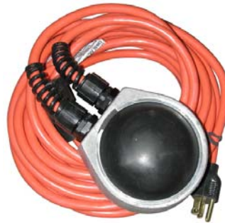
REL-C-FS-1 FOOT SWITCH