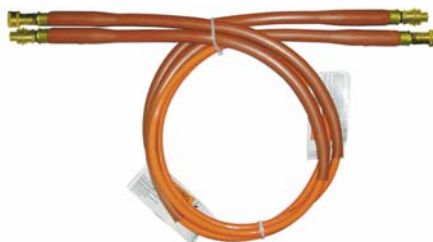
3VE3 10,000 PSI HOSE SET