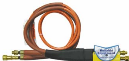
PVA 1122 CONTROL VALVE W/ 3VE3 HOSES