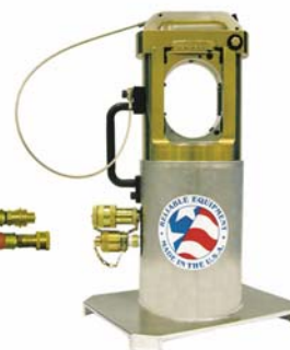
REL-60DA D/A CRIMPING HEAD

The REL-10-I-S/DA is the perfect 10,000 psi power source, providing all the benefits of a double acting tool system, while complementing existing single acting tool inventories.