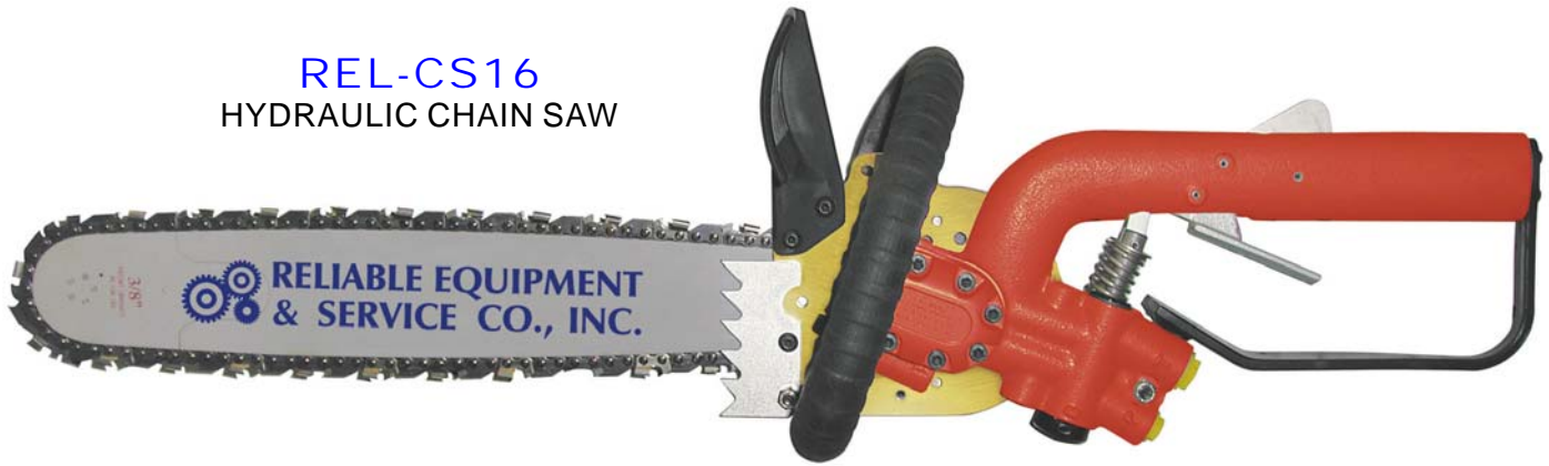
REL-CS16 HYDRAULIC CHAIN SAW