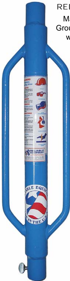
REL-MGRD-TH Manual Temp. Ground Rod driver with handles