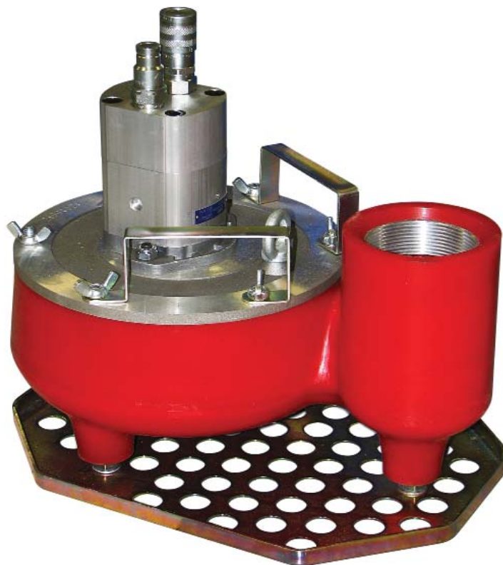
EP300 WATER PERFORMANCE (3-INCH DISCHARGE SIZE)

The urethane bowl and impeller are extremely durable and light weight. Hard and sharp materials bounce off instead of abrading the interior surfaces, making this design last longer and perform better than aluminum, iron and even steel pumps.