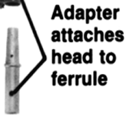
Adapter attaches head to ferrule