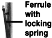
Ferrule with locking spring