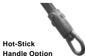
Hot-Stick Handle Option

Hook-to-Hook: 27 in. Min. 6 ft. Max. Standard Lift 3 ft.. 9 in.