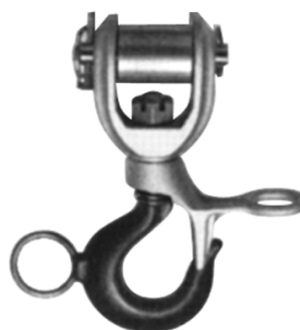
Hot Stick-Type Gate Latch

TO ORDER CALL: 800-966-3530 OR FAX: 215-357-9193