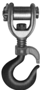
Swivel Type Gate Hook

DHA - Includes Hot Stick-Type Gate Latch on All Hooks as well as Hot Stick Rings on All Hooks, Control Surfaces and Quick Disconnect Shaft.