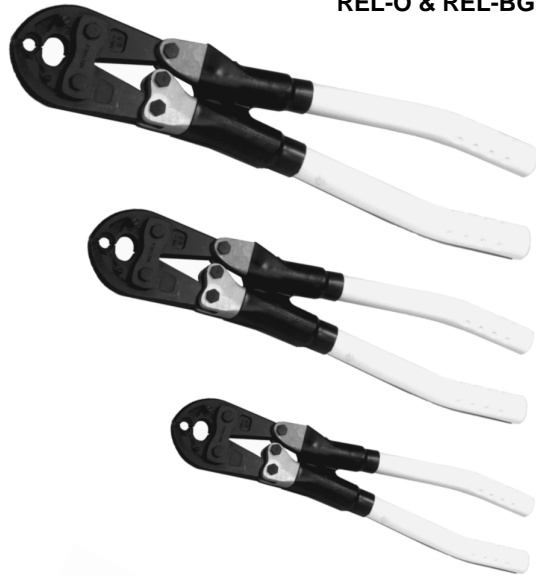
REL-O & REL-BG