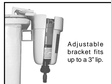
Adjustable bracket fits up to a 3" lip.