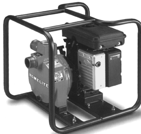
#111 S2 Centrifugal Pump