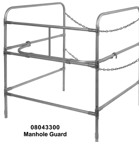
08043300 Manhole Guard