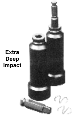
Extra Deep Impact

For your convenience an Adapter Shank and Retainer Clips are included in each Extra Deep Impact Socket.