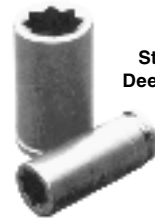
Standard Deep Impact