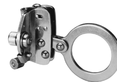
8175 Rope Grab