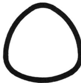
End View Actual Size

Ergonomic design provides a better gripping surface for optimized operator control. All Sticks have hanger hook. Color is flourescent green for high visibility.