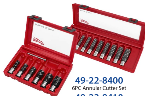
49-22-8400 6PC Annular Cutter Set 49-22-8410 9PC Annular Cutter Set