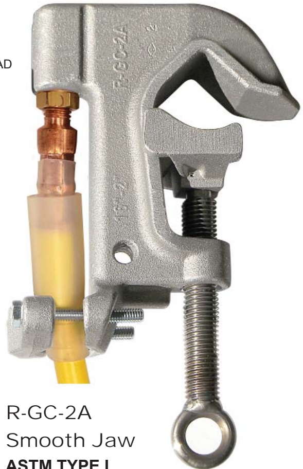
R-GC-2A Smooth Jaw ASTM TYPE I Class A • Grade 5/5H