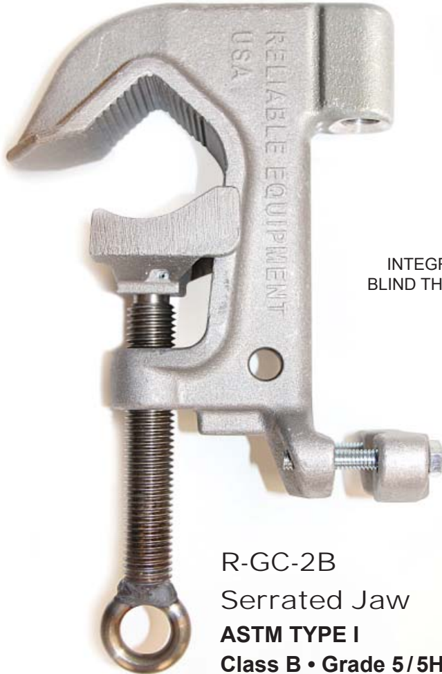
R-GC-2B Serrated Jaw ASTM TYPE I Class B • Grade 5/5H