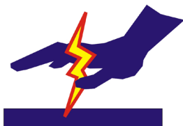
ELECTRICAL SHOCK HAZARD