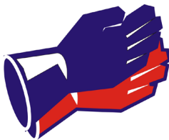
GLOVES PROTECTIVE GARMENTS